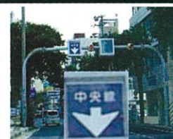
The sign of the Center line.

Okinawa Prefectural Police HQ (Main switchboard) 098-862-0110