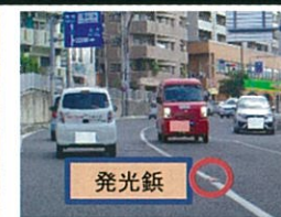
The Luminous rivets.