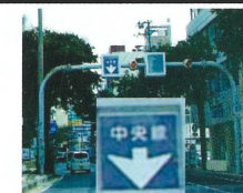
The sign of the Center line.

Okinawa Prefectural Police HQ (Main switchboard) 0 9 8 - 8 6 2 - 0 1 1 0