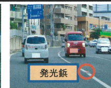
The Luminous rivets.